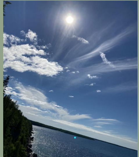
Little Cove, Bruce Peninsula, July 2020