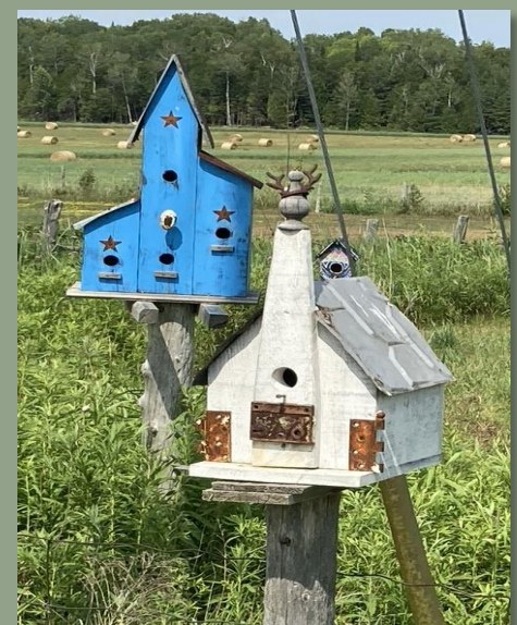
Stokes Bay, Northern Bruce Peninsula, July 2020