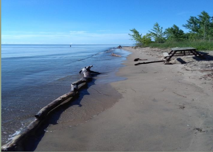
Lake Erie Log