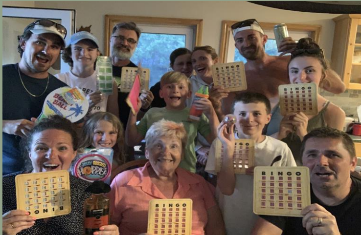
Bingo in the Rain