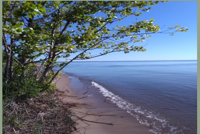
Lake Erie Waves