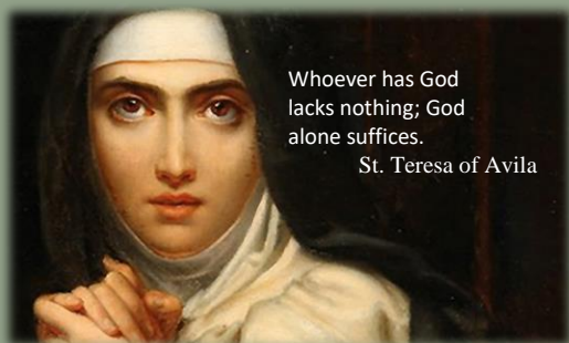
Whoever has God lacks nothing; God alone suffices. St. Teresa of Avila