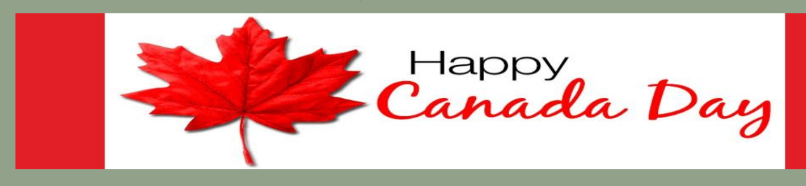
On July 1, 2021 our office will be closed.